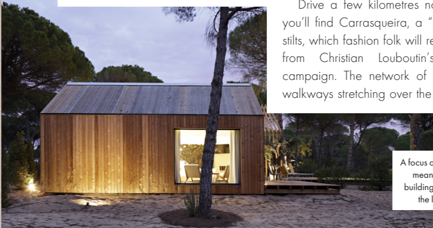
A focus on sustainability means the hotel's buildings complement the landscape