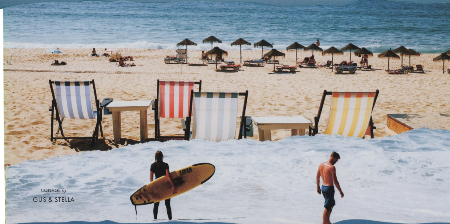
COLLAGE by GUS & STELLA

LOOK NO FURTHER THAN THESE SUPER-STYLISH BOLTHOLES BY SOME OF THE WORLD'S BEST BREAKS